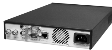
NET4001A TRANSMITTER/RECEIVER (REAR)

The NET4001A brings DVD quality video in MPEG-2 or MPEG-4 format to Pelco's line of video transmission systems. Additionally, its versatility as a transmitter or receiver eliminates the inconvenience of ordering different products for transmitting and receiving video.