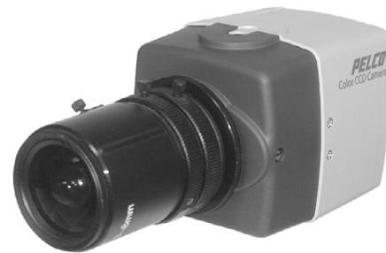
(LENS NOT SUPPLIED WITH CAMERA)

The CCC2400S-4 Series is one of Pelco's smallest and most economical cameras, providing true color reproduction and image quality at a great price. Its compact size makes it ideal for Pelco's DF5 and DF8 domes and EH100, EH2508, and EH3508 enclosures.