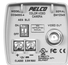
CCC2400S-4 REAR VIEW

The CCC2400S-4 Series has a standard CS lens mount, but with the optional PMCA40 lens adapter, C-mount lenses can be installed. A wide variety of fixed, varifocal, and zoom lenses can be used with either manual or auto iris. Auto iris lenses must be DC drive only. The iris is controlled through a standard four-pin square connector that is included on all Pelco auto iris lenses.