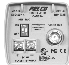
CCC2400H-4 REAR VIEW

The CCC2400H-4 Series has a standard CS lens mount, but with the optional PMCA40 lens adapter, C-mount lenses can be installed. A wide variety of fixed, varifocal, and zoom lenses can be used with either manual or auto iris. Auto iris lenses must be DC drive only. The iris is controlled through a standard four-pin square connector that is included on all Pelco auto iris lenses.